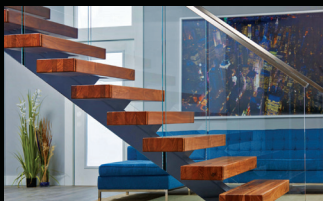
Stairs & Handrails