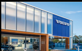
Entrances & Storefronts