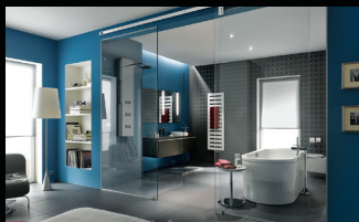
Shower & Bath Enclosures