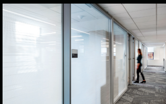
Doors & Partitions